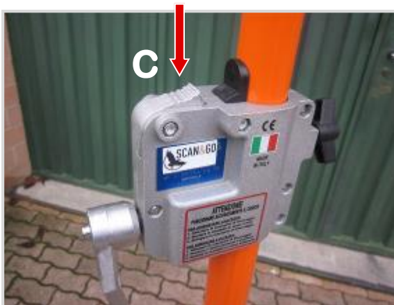
Press down the safety catch (C) on the winch without releasing it

To descent the UPLIFT proceed as follows: