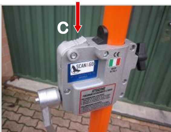
Press down the safety catch (C) on the winch without releasing it

To descent the UPLIFT proceed as follows: